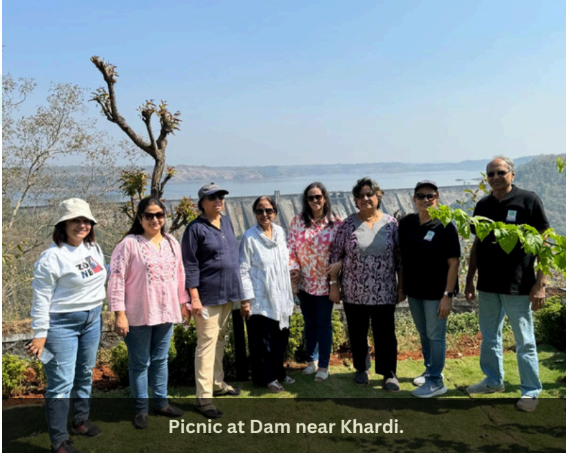
Picnic at Dam near Khardi.