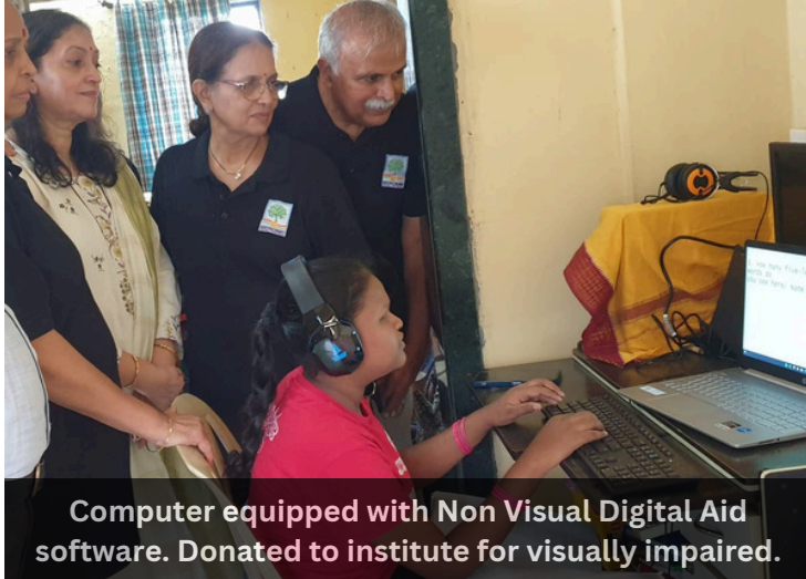
Computer equipped with Non Visual Digital Aid software. Donated to institute for visually impaired.