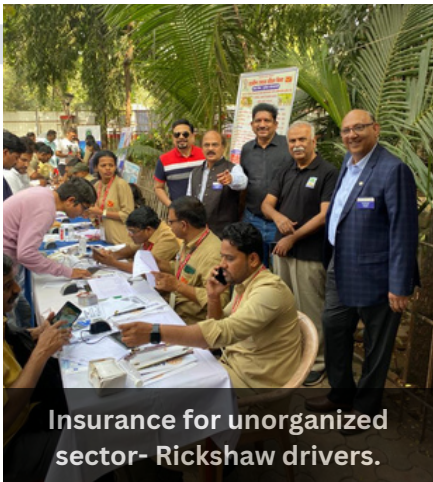
Insurance for unorganized sector- Rickshaw drivers.