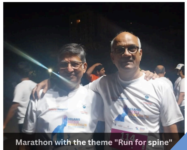
Marathon with the theme "Run for spine"