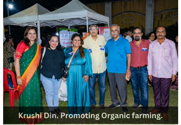
Krushi Din. Promoting Organic farming.