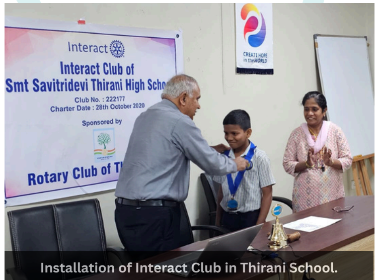
Installation of Interact Club in Thirani School.