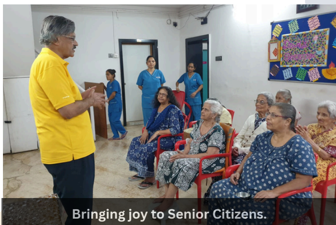
Bringing joy to Senior Citizens.