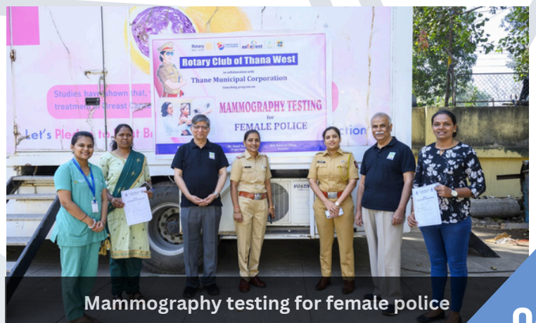
Mammography testing for female police