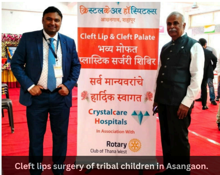
Cleft lips surgery of tribal children in Asangaon.