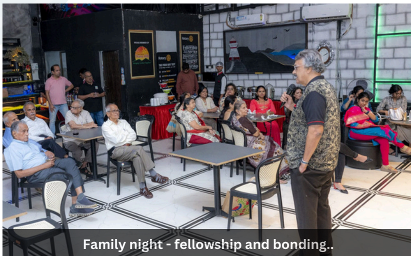
Family night - fellowship and bonding..