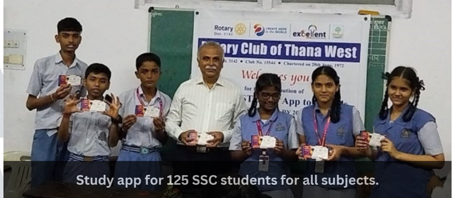
Study app for 125 SSC students for all subjects.