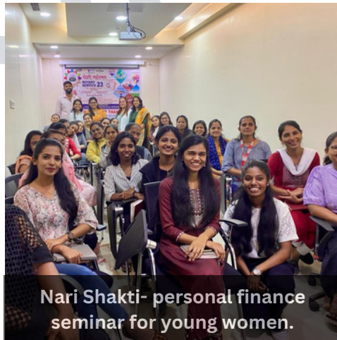
Nari Shakti- personal finance seminar for young women.