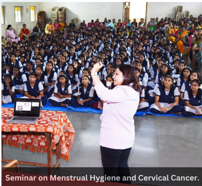
Seminar on Menstrual Hygiene and Cervical Cancer.