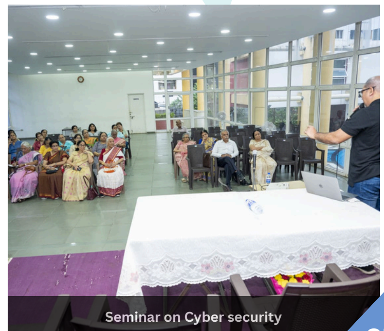
Seminar on Cyber security