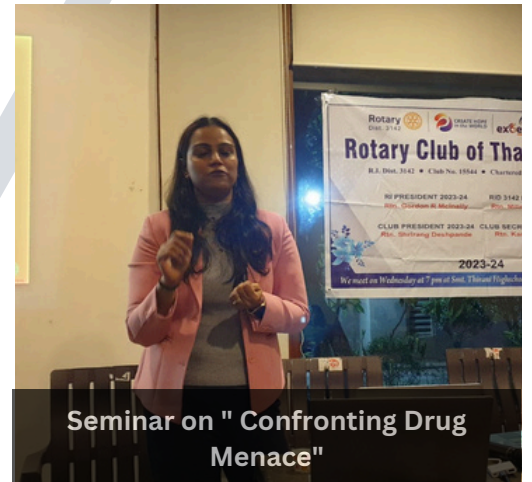
Seminar on "Confronting Drug Menace"