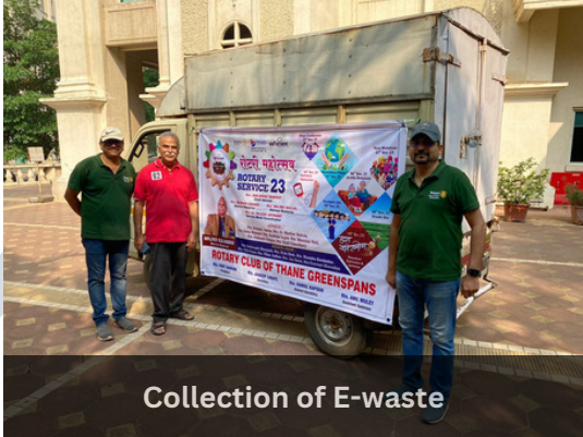
Collection of E-waste