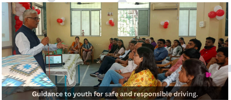
Guidance to youth for safe and responsible driving.